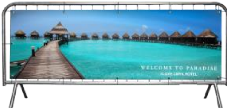
Crush barrier banner Second example